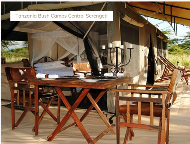
Tanzania Bush Camps Central Serengeti

View 2 Alternative Accommodations - From Page 2